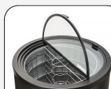
Tempered glass top