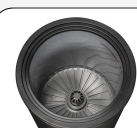
Inner assistance fan